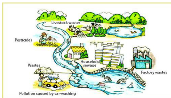
Figure 2: Water Pollution

Water pollution has become a severe environmental problem mainly due to the extensive anthropogenic activities: direct or indirect discharging of effluents containing toxic materials into water ways without proper treatment which causes chemical, physical and biological changes in water bodies. Hence, the depletion of suitable water quality causes life threatening waterborne diseases like cholera, typhoid, diarrhea, bowel diseases, and chronic illnesses in those people who rely on these water sources for their domestic activities.